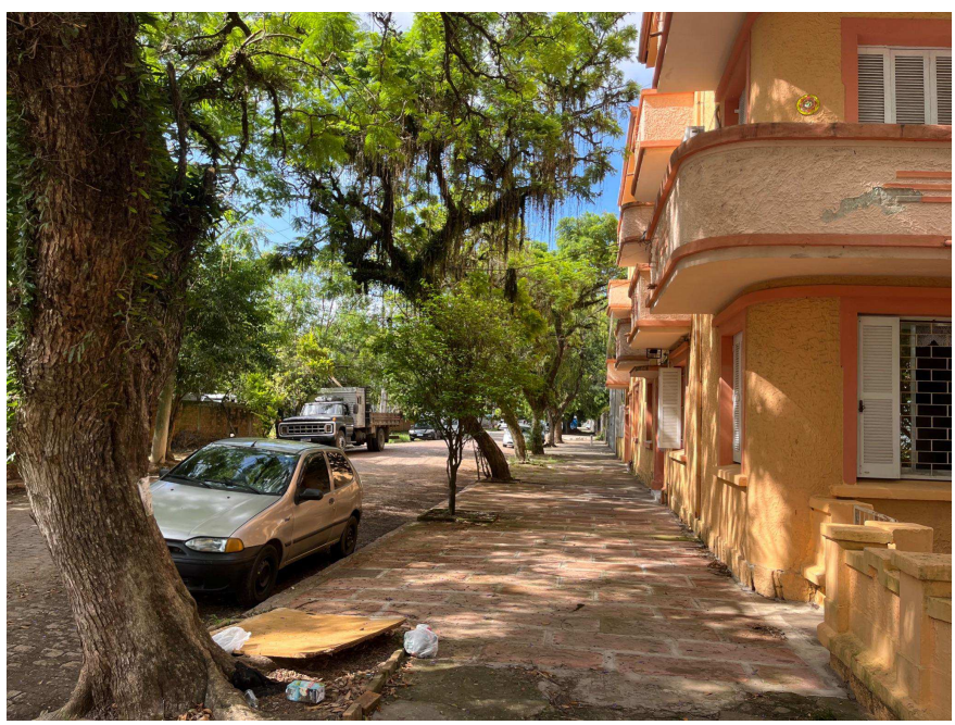
Fig. 2: Example of a street atmosphere in the Fourth District today - the desired future may have already existed.

Some of these buildings still stand resilient (see fig. 2), as a piece of resistance, despite facing challenges from social, economic, and environmental pressures, as well as the influence of the starting real estate production. When prompted to "keep planning for the real world," especially in revitalizing old areas to meet contemporary needs, it seems prudent to carefully consider what these needs entail. It's possible that the solution for them has already existed, and we merely need to adapt them to our current circumstances. In truth, genuine progress reminds us that our fundamental human needs remain relatively unchanged over time. However, we often overlook them, distracted by the multitude of tasks and information that bombard us daily.