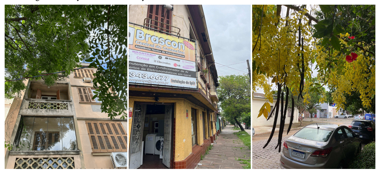
Fig. 3,4 and 5: Some dynamics existing in the Fourth District nowadays – this is REAL.

Coexisting in harmony with Nature is key.