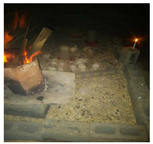
Fig. 2: iMbawula to keep her chickens warm and comfortable during the cold winter.

Another strategy that has been employed is during the extreme winter months, in the absence of a broiler, chickens are sensitive to cold temperatures, and prolonged exposure to low temperatures can lead to cold stress. This can result in reduced egg production, decreased feed consumption, and overall poor health. Livestock farmers have employed the ingenious "iMbawula" method, to create a cozy and comfortable environment for her cherished chickens amidst the chilly winter season. This implies building a round metal container and lighting up some fire wood inside of it which then produces heat for the chicken (see figure below).