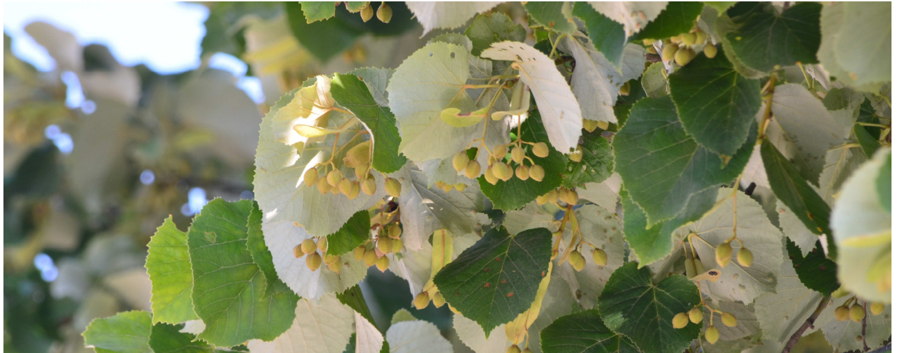
Figure 1: Photograph depicting the leaves of a silver lime tree located in Kaiserslautern, Buchenlochstraße, on 22 August 2023. The photograph shows the contrast between the dark green upper side and the light, silvery underside of the leaves [Geib 2023].

( Tilia cordata ). This is probably due to its silver-haired leaves (refer to Fig. 1) and the ability to actively turn its leaves in hot weather (refer to Fig. 2). As a result, the silver lime tree is less likely to exceed critical temperature thresholds compared to the small-leaved lime tree [Schönfeld 2022, pp. 2-6]. Therefore, Tilia tomentosa is classified as highly suitable for drought tolerance and suitable for cold hardiness [Roloff 2013, pp. 176-182].