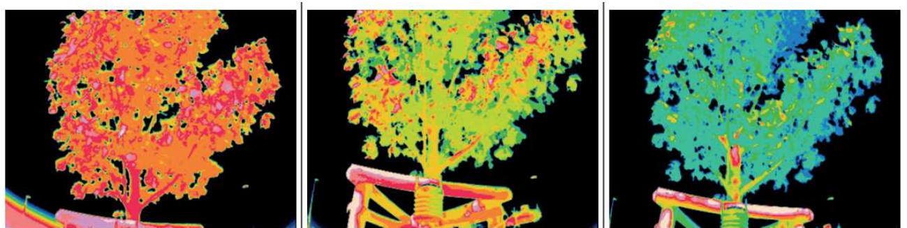
Figure 2: Thermal imaging camera images before rotation (left), during rotation (centre), and after rotation (right). High surface temperatures are represented by red-coloured areas and lower surface temperatures by blue areas [Henninger 2020, p. 76].

The leaves of the silver lime are initially covered with star-shaped hairs on the upper side but often become completely bare later [Binder 2015, p. 23]. The underside of the leaves has a dense layer of star-shaped hairs, giving them a silvery appearance, and sunken stomata [Böll et al. 2021, p. 5; Binder 2015, p. 23]. This hairy layer prevents aphid infestation and honeydew, while also protecting against heat and excessive evaporation [Roloff 2013, p. 159]. When exposed to extreme heat, the silver lime tree turns its leaves so that the lighter underside faces upwards, reflecting the incoming solar radiation. The change in albedo reduces the surface temperature of the canopy (refer to Fig. 2) as well as the air temperature under the canopy and around the trunk area [Henninger 2020, p. 76].