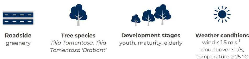
Figure 3: Overview of the objects and conditions of the investigation [Geib 2023].

The aim of this study is to investigate the impact of trees on the microclimate of street canyons during warm summer conditions and extreme heat, as this is when the cooling benefits of trees are most significant. To achieve this, the following meteorological conditions have been defined: data will only be recorded on summer days with little wind ( \leq 1.5 \text{ m s}^{-1} ), clear to almost clear skies (degree of cloud cover \leq 1/8 ) and a temperature of at least 25 °C (refer to Fig. 3) [Geib & Henninger 2023, p. 44].