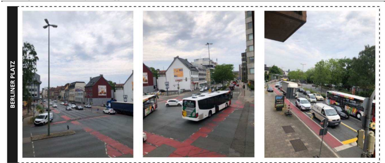
Figure 3: Photos of Berliner Platz