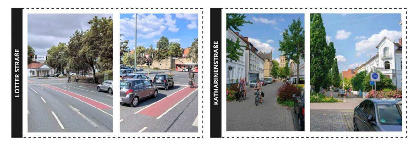
Figure 4: Photos of Lotter Strasse - Natruper-Tor-Wall (left) and Bicycle Road Katharinenstraße (right) (Maximilian Heinke)

All in all, the data shows high amounts of stress levels or rather high accumulations of MOS. Relating problems in the design of those major intersections like this are discussed in literature and mobility panels under the aspect of subjective safety. Here protected intersections and roundabouts standardized in Dutch traffic guidelines (Rik de Groot, 2016) can be named as a possible design solution, that needs to be further examined using the methodology detailed in Chapter 5, adding quantifiable data to the discussion of road distribution objective and subjective safety of different street users, especially considering the needs of pedestrians.