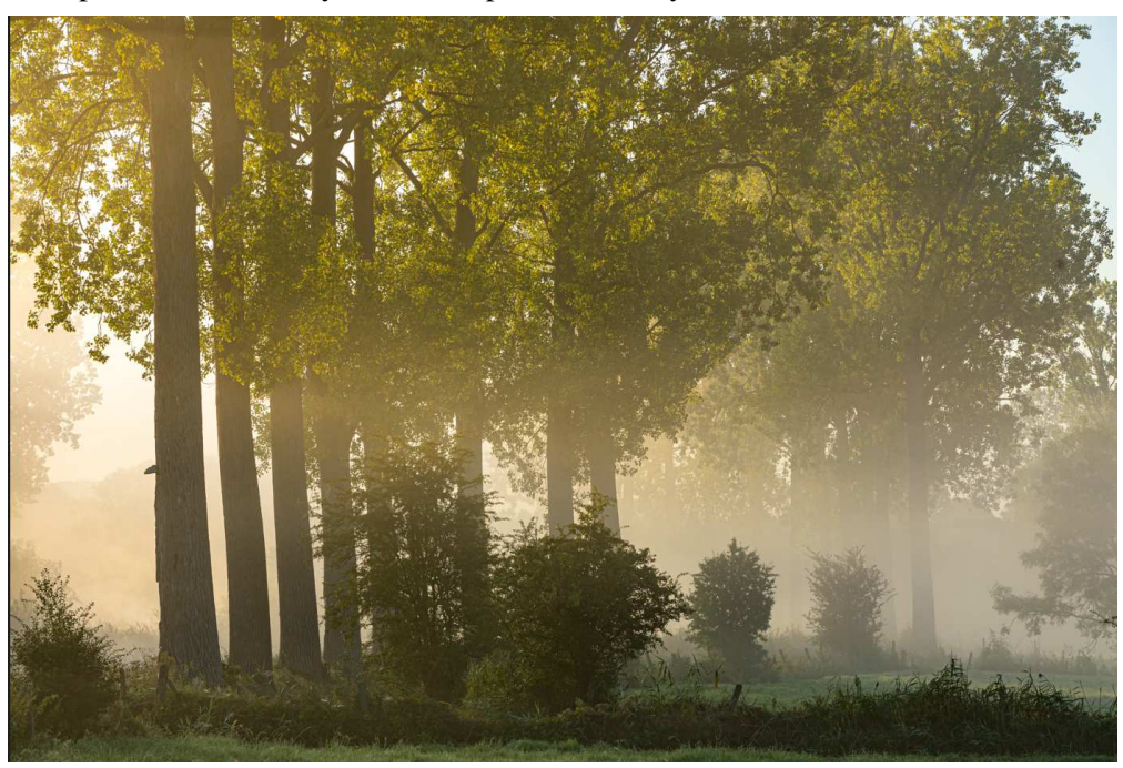
Gert Arijs 2019

Other ways to reduce the tree fellings according to the study are: stricter regulations, fewer felling permits and good communication ('what is the use of trees?'). Good commication may be important for sensitisation, but the two other possibilities are beyond the scope of this study, and we will not discuss it here.