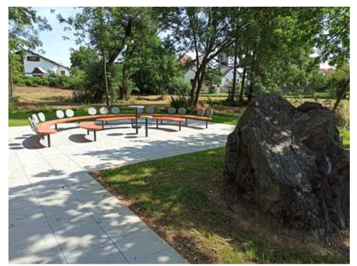
Fig. 2: Picture of the outdoor class of the BORG Güssing

The units will be installed in the summer of 2023. It is assumed that there will be a significant reduction in room temperatures during the night hours, which should result in a much more pleasant indoor climate, at least in the mornings. In addition, an outdoor class (see Fig. 2) has been installed to escape the hot classroom on particularly hot afternoons.