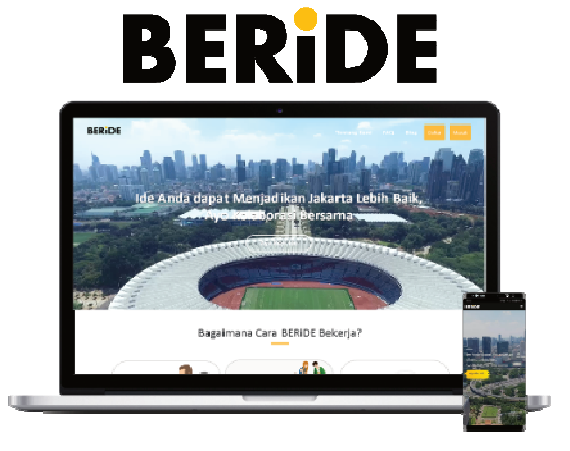
(Beri-Ide/Give an Idea) Tools to Bring Up Your Idea

In this decade, cities in the world are competing to provide various digital applications in order to create an easier daily life for their citizens, so that the cities can be categorized as smart cities. In Indonesia, it is most likely happened in big cities such as Jakarta, Bandung and Surabaya. Smart city is expected to become a future city concept which also includes smart environment, smart governance, smart people, smart living, concept smart mobility, and smart economy concepts. Most of the time, Smart City is identified with only digitizing process and implementing mobile apps, while in fact, smart city concept is way more complex than just about developing some mobile applications.