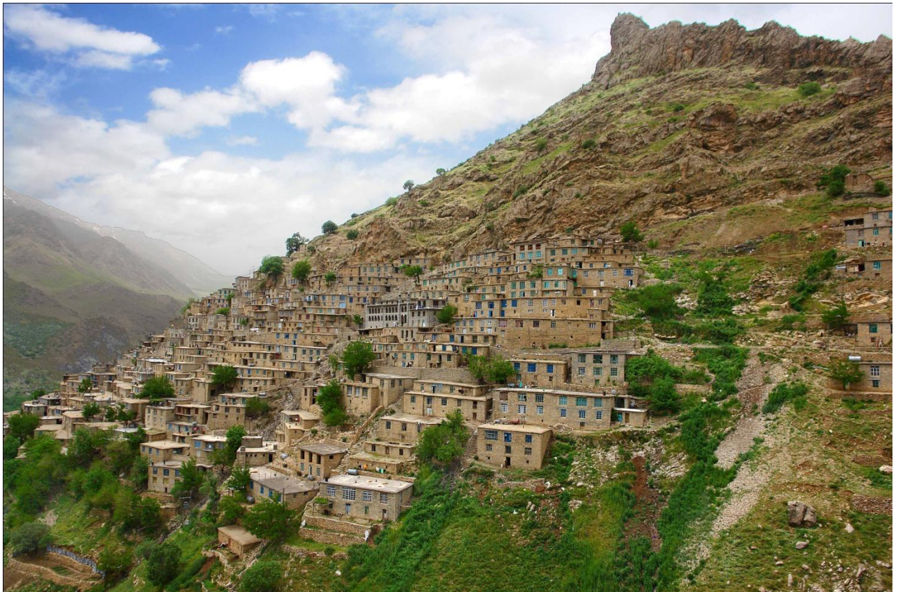
Fig. 6: Buildings toward South (using solar energy)

The connection and coheres on public texture image and serial juxtaposition method toward South in order to prepare the light and heat are features. Using solar energy is very vital due to difficult transportation of fossil fuel.