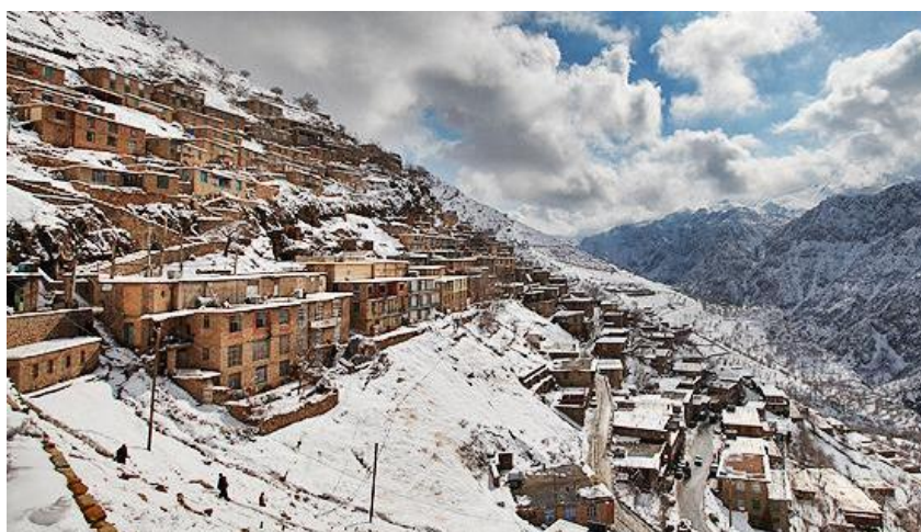
Fig. 2: Hawraman-e Takht in winter

Hawraman-e Takht and Marivan are located in a very cold mountainous region which has cold winters with long snowfalls and short and cold summers. This area is very high in comparison to the sea and is surrounded by Northern Zagros mountain range which causes extreme weather and difficult climatic conditions.