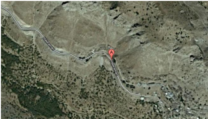
Fig. 1: Satellite map of Hawraman-e Takht

It is the center of Uramanat which is located in southeastern Marivan with a 75Km road linking to Marivan this village is located in an East –west valley in a steep declivity opposite the northern side of the Takht Mountain. [1]