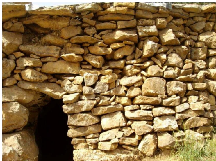
Fig. 8: Stones without the use of any construction materials

The materials which are used have high heat capacity; they hold heat and prevent the heat loss. Local wood has been used in making doors and windows and also wood has a vital role in columns and covering the ceilings.