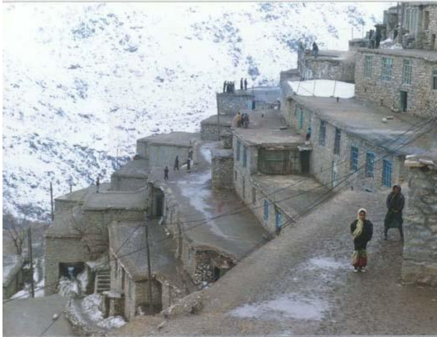
Fig. 5: Stair way shape of the village