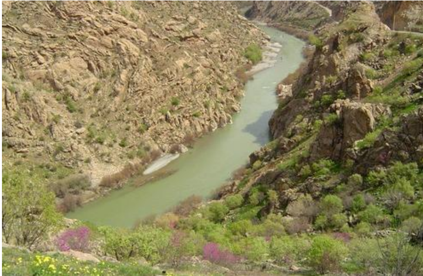
Fig. 3: Sirvan River

Permanent spring waters, and water well and "Sirvan" river are the main water resources. Sirvan is a significant water resource that two parts of this river reach this area from North and southeast, and after they meet each other in a place called "Duab" and then leaves Hawraman and Kurdistan province and finally reaches to Darbandikhan dam in Iraq. [3]