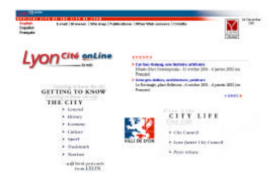
Figure 1. Lyon homepage (English version).