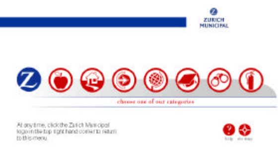
Figure 2. Zurich Municipal homepage.

Verbal menus are more and more replaced by visual menus. Figures 2 and 3 give homepages for Zurich Municipal and Milano*. Let us examine Zurich Municipal homepage: the student hat seems to indicates a link to schools, but the apple meaning is not very clear: in reality, this is for health services<sup>2</sup>. In our culture, since the visual vocabulary is not totally standardized (in contrast with iconic languages such as Chinese, Egyptian, Mayas, and so on). To avoid this kind of problem, a hybrid combination of words and icons is generally used. See for instance Edinburgh* and Lynchburg (VA)*. An other example is Palermo* homepage.