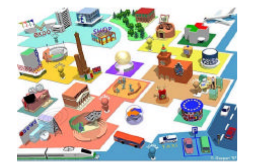
Figure 4. Bologna homepage. See http://www.comune.bologna.it.