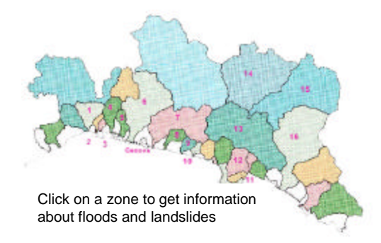
Figure 6. Genoa* hypermap for risks. Source: http://www.provincia.genova.it/pdb/pdb03.htm.