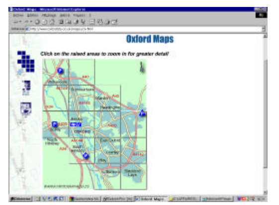
Figure 5. A gridded hypermap for Oxford*.

A very interesting way of organizing geographic information is to use hypermaps (Laurini-Milleret-Raffort, 1990, or Laurini, 2001), also called clickable maps. Figure 5 gives an example of a gridded map for Oxford* (UK). Another example is given by the province of Genoa* (Italy) for urban risks, especially for landslides and floods. For the English city of Dover*, an hypermap allows the access to city councilors description through their districts. In Venice, Italy, an original entry system is provided through aerial photos (Figure 7).