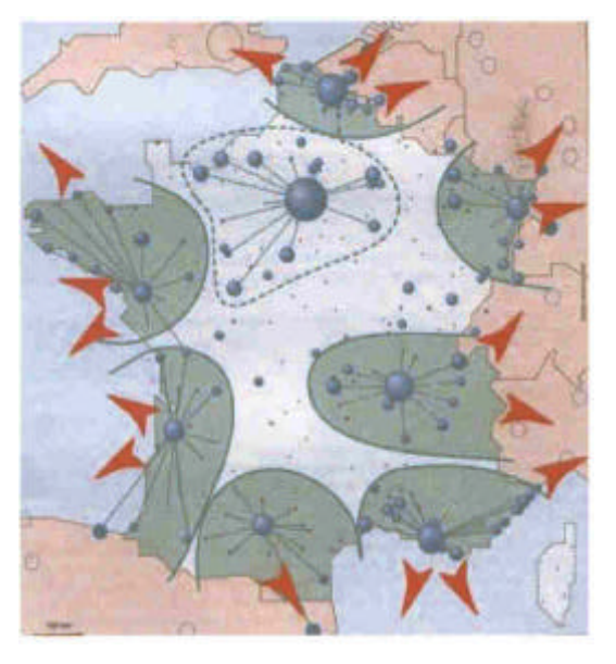
Fig. 5: 'Centralisme rénové'