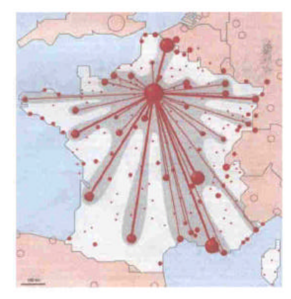
Fig. 4: 'L'archipel éclaté'

The scenarios (4) and (5) represent extremes with respect to the role of Europe (or the EU). The 'European issue' implies a larger EU marked by a strong, political integration. This would enable the EU to implement the ESDP as a European answer to globalization as a challenge to be accepted. Though within a perspective of sustainability emphasizing not only economic performance but also social cohesion and a balanced environment. The 'Redefinition of the national project' on the other hand, in fact, implies a failure of the EU. Struggling with scarcity, the nation states will be searching for national solutions. In France, this would imply another scenario, ie 'Le centralisme renové', a country structured according to the center-periphery model, of course, with Paris as the dominant center (figure 4). This development would be further reinforced by the fear as expressed by the scenario of the 'Archipel éclaté': France as an archipelago, desintegrating under the influence of globalization (figure 5) Scenario (5) is, indeed, an extreme one.