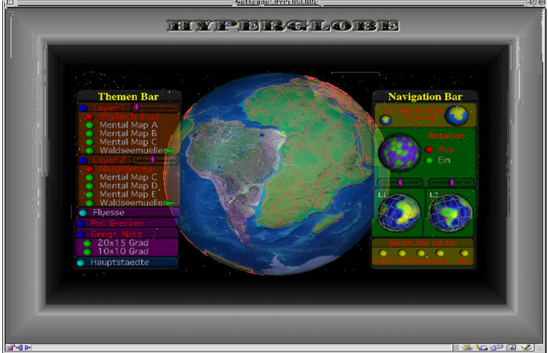
Fig. 2: Virtual globe based on VRML97 (http://www.gis.univie.ac.at/hyperglobe/index.html)

and Virtual Reality systems make feasible the development of a virtual globe. This Virtual Globe can show worldwide themes in a collective way, so that different themes can be compared and relationships more easily found. Visualisation using the general concept of VR expands the possibilities of geomultimedia as VR-systems allow the implementation of multimedia techniques in what appears to the user as a real existing space. Users are able, as they would in the real world, to move freely within this space or to rotate/move and investigate the digital model, or parts of the model. The interface provides users opportunities to commence an active communication process and perform specific user defined tasks and queries. The resultant use of a Virtual Globe, which can provide purposeful and specific information via different interactive functions, depending upon user needs, which may change according to the varying degrees of geometric or thematic complexity.