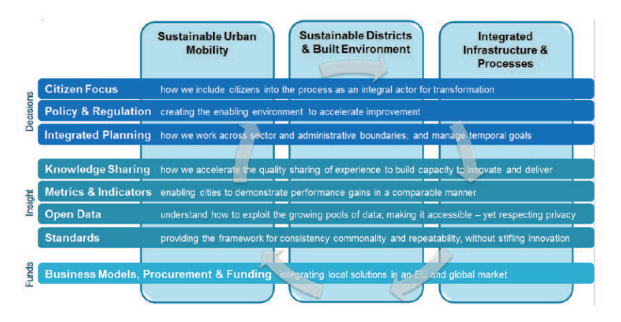
Figure 1: Priority areas of European Innovation Partnership on Smart Cities and Communities<sup>5</sup>

In 2012 and 2013, the EIP SCC published two key documents on the EC approach to Smart Cities and Communities: The Strategic Implementation Plan (EIP SCC) <sup>4</sup>and the Operational Implementation Plan (OIP SCC). These documents define the European Smart City activities as resting on three vertical pillars (Sustainable urban mobility, sustainable districts & built environment, integrated infrastructures & processes) combined by eight horizontal priority areas that work as enablers: Citizen focus, policy and regulation, integrated planning, knowledge sharing, metrics & indicators, open data, standards, business models, procurement & financing.