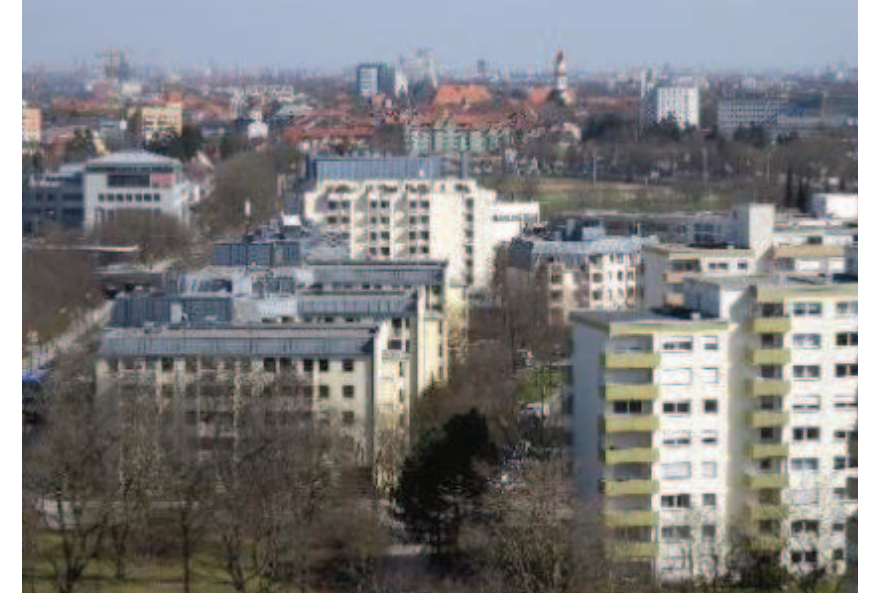
Figure 4: Light House Area in Munich

"Smart City Munich" puts additional emphasis on the integration of intelligent technologies (energy efficient buildings, sustainable urban mobility, intelligent energy management systems etc.) which support the transition to a post-fossil city. For this transition, Munich set itself ambitious climate goals within the "Integrated Action Programme for Climate Protection", to which the Smarter Together projects are set to contribute: The aim is to reduce CO2 emissions by 10% every five years and to halve per capita emissions by 2030 (from a 1990 baseline); to cover the complete electricity demand of Munich from renewable energies in 2025; to complete the conversion to renewable energy district heating by 2040.