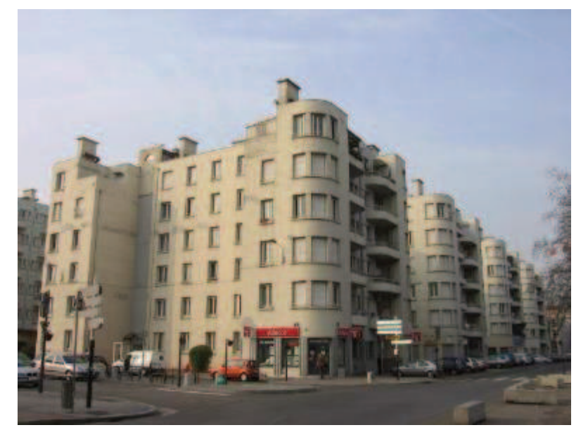
Figure 3: Light House Area in Lyon

In addition to this, another objective is provide to the Grand-Lyon data platform new sets a dynamic data from the energy sector and the sustainable mobility sector collected by many various sources: smart power and heat meters, building energy management system, energy production systems in the area such as photovoltaic systems and the district heating power plant). These new sets of data will be used to develop new applications or will be used by existing applications such as the Community Management System (CMS) developed by Toshiba that will be used to have a global understanding of the energy flows of the district in order to improve the urban planning process and the planning, design and operation of public infrastructure.