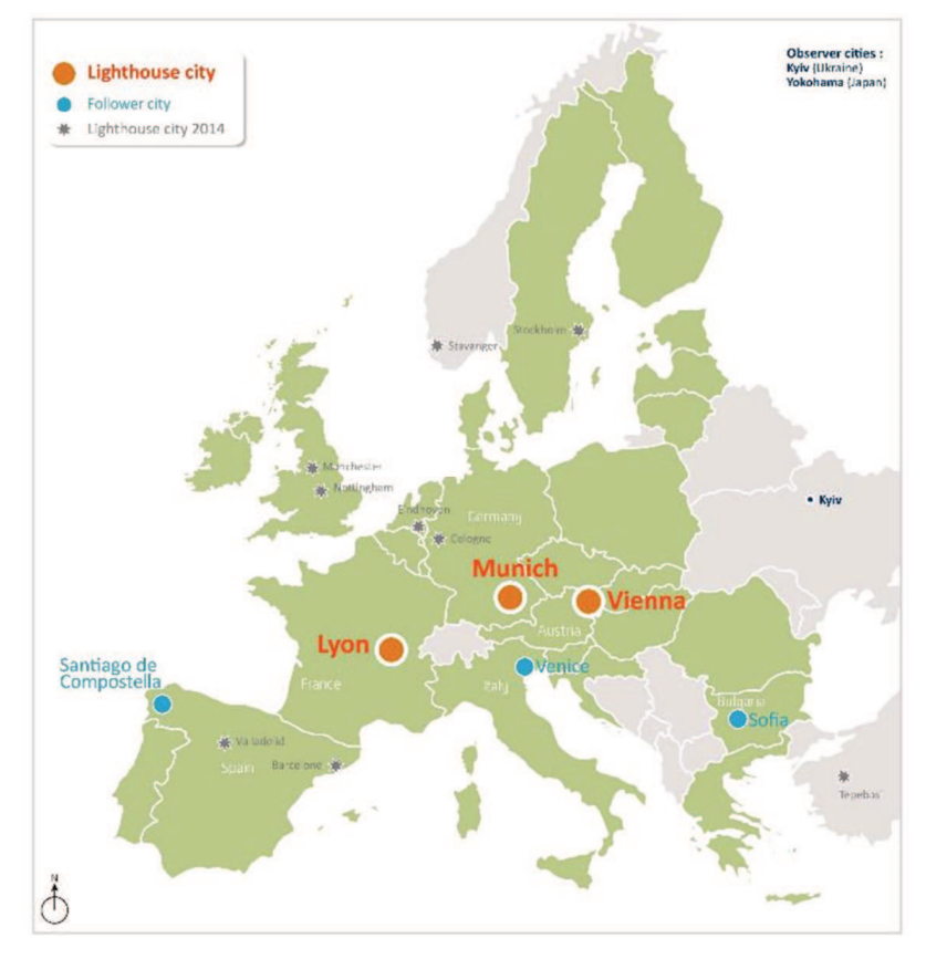
Figure 2: Light House Cities and Follower Cities of the SMARTER TOGETHER project