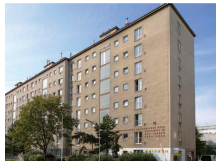
Figure 5: Light House Area in Vienna

In 2014, the City of Vienna adopted the so-called Smart City Vienna Framework Strategy (Smart City Wien Rahmenstrategie – SCWR) as a medium to long-term umbrella strategy for integrated urban development. For example, the strategy aims at a reduction of energy consumption by 40% by 2050, an increase of renewables from 10% to 50%, a reduction of motorised transport from 29% to <15% while maintaining green space at 50%